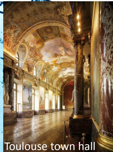
Toulouse town hall